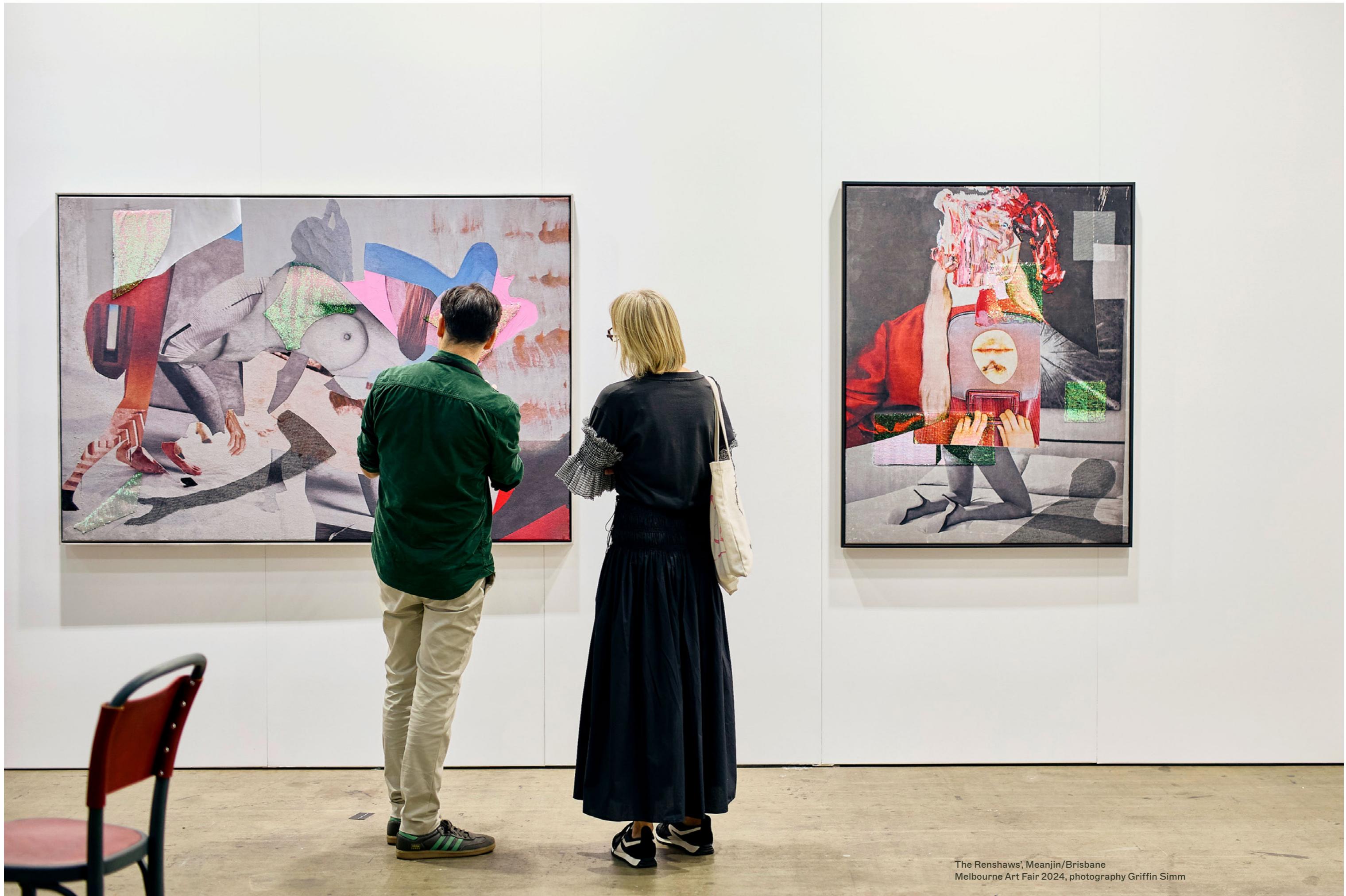
The Renshaws', Meanjin/Brisbane Melbourne Art Fair 2024, photography Griffin Simm