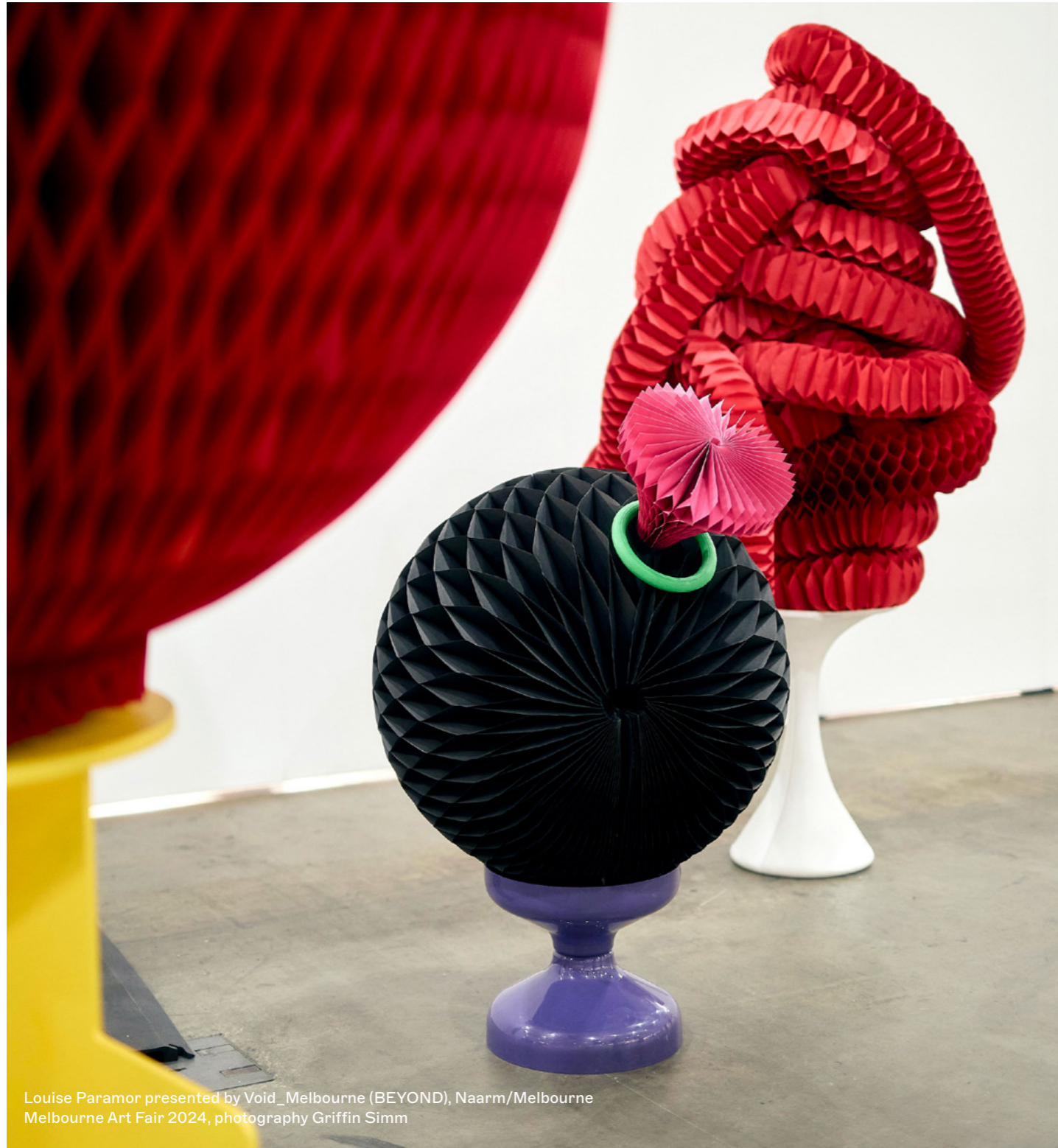
Louise Paramor presented by Void_Melbourne (BEYOND), Naarm/Melbourne Melbourne Art Fair 2024

Participate in an art fair that is instrumental in shaping the future of art in the region, a progressive forum for contemporary art and ideas.