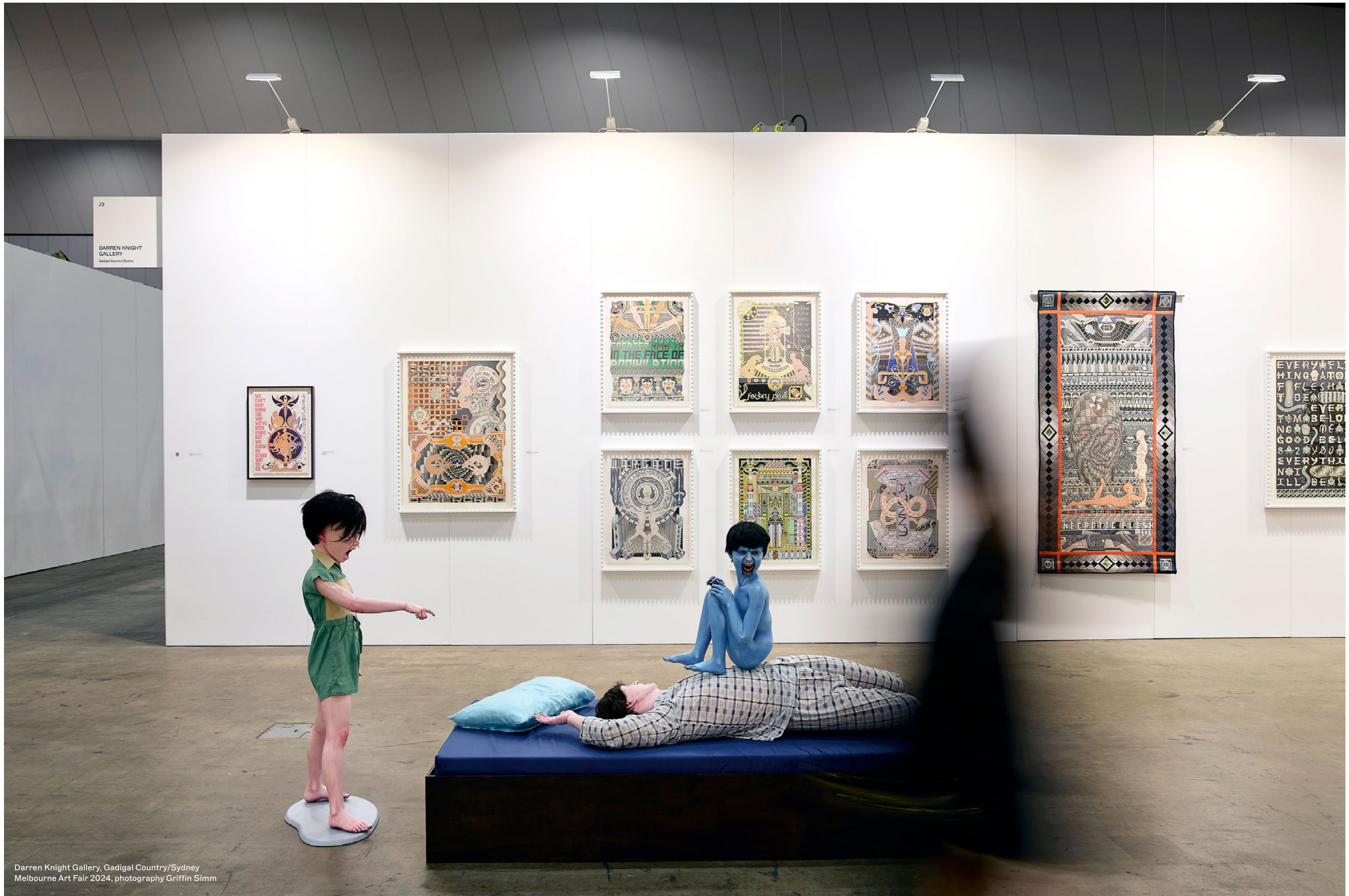
Darren Knight Gallery, Gadigal Country/Sydney Melbourne Art Fair 2024, photography Griffin Simm